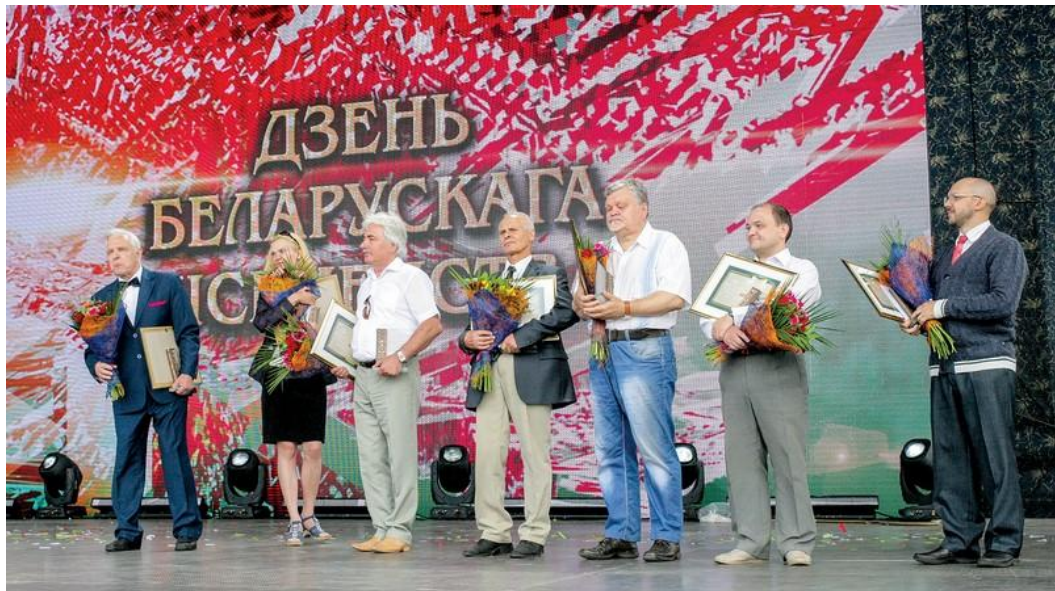
Over 70 events held in Rogachev as part of Belarusian Written Language Day