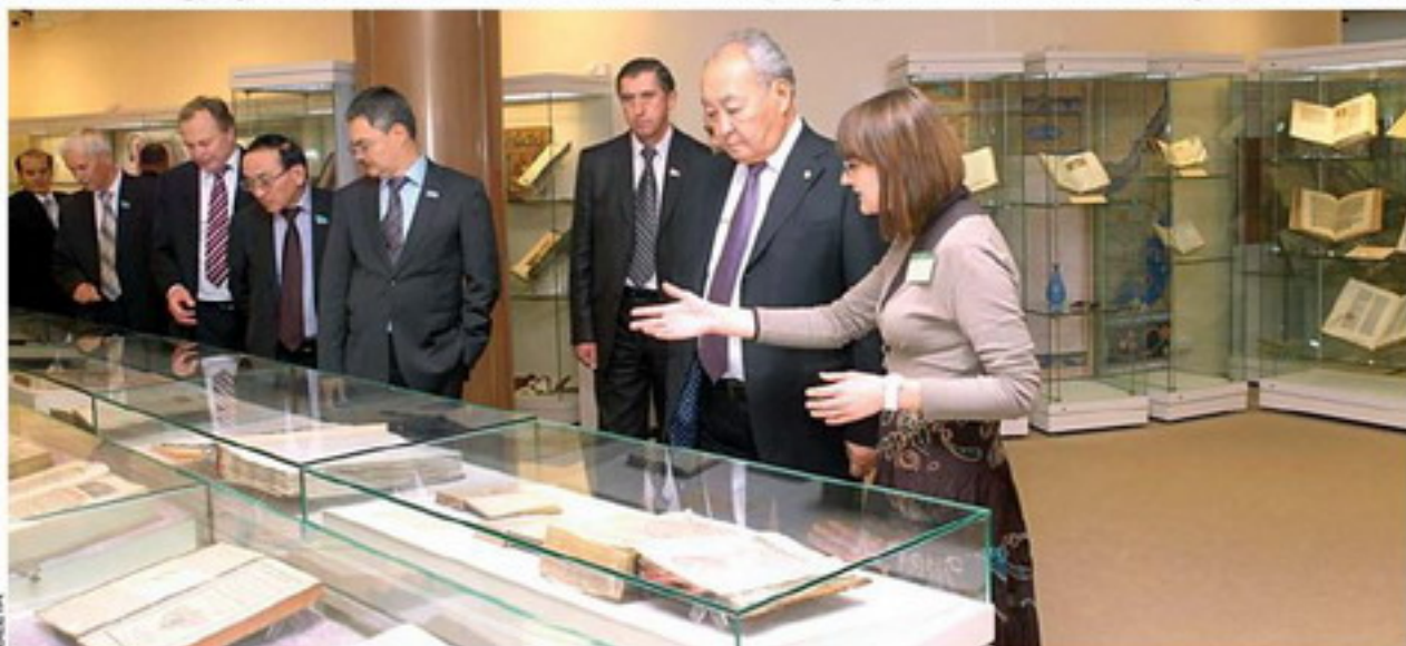
Exhibition enjoys interest among foreign guests

Mr. Lukashenko has also wished staff and readers of the National Library good health, success in their work, happiness and prosperity.