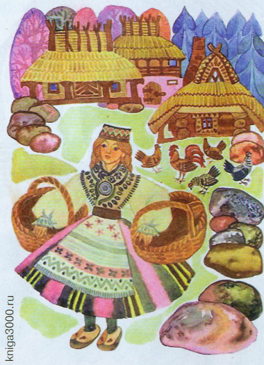
A work by N. Poplavskaya

According to the show's organisers, Inspiration in Tandem largely reflects the significant contribution that the Poplavsky couple made to the development of Belarusian fine arts. Over 60 documents are exhibited, including original works with the artists' autographs.