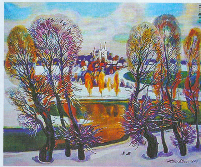
Protection of the Theotokos. Georgy Poplavsky